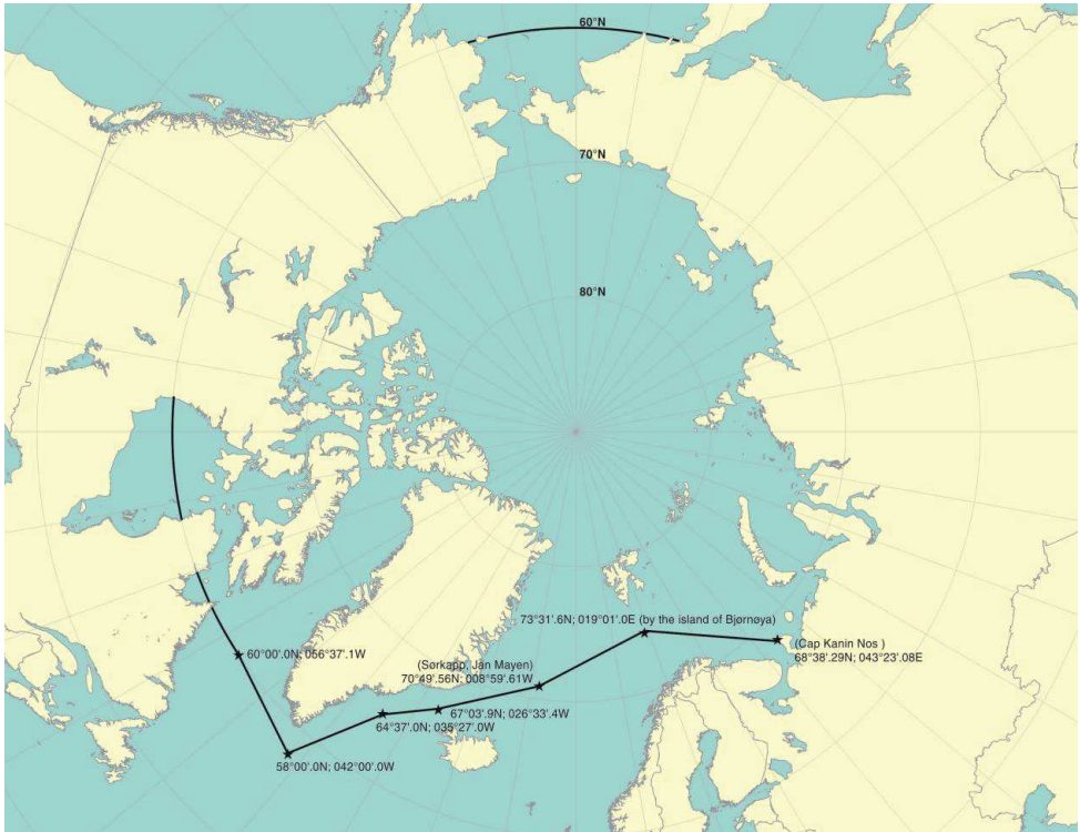
Figure 2 – Maximum extent of Arctic waters application 3